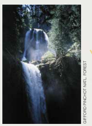
Many stunning waterfalls and more await you...